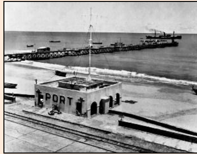
(The port at Pondicherry where Sri Aurobindo had landed in April 1910)